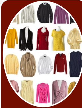
Flat Knit Department.