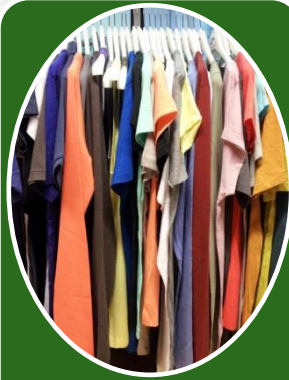
Circular Knit Department.